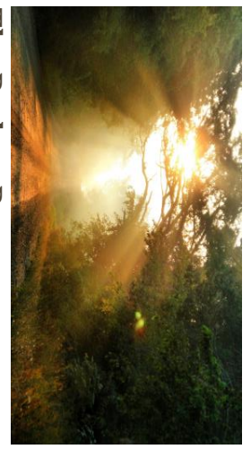
The Path to Pentecost